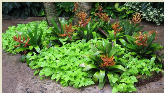
Discovery Cove (Orlando)