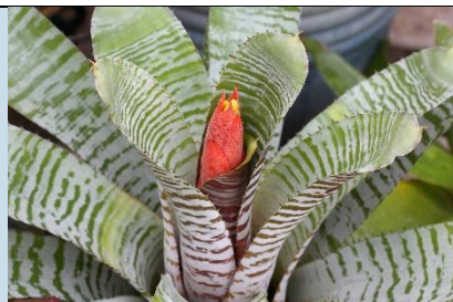
Aechmea 'Dark Deleon'