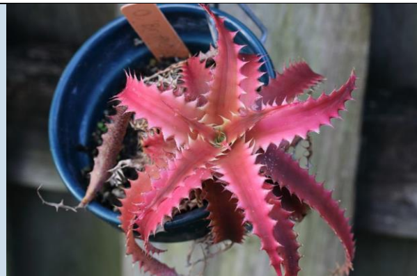
Orthophytum 'Brittle Star'