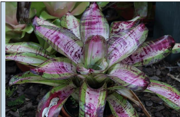
Neoregelia 'Linda Cathcart'