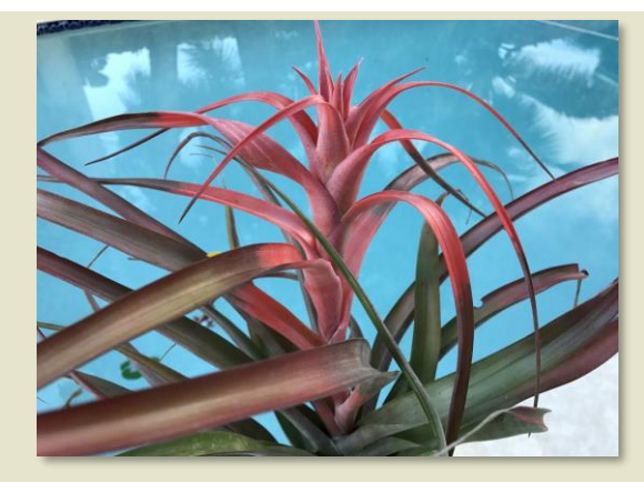
Tillandsia 'Fire Orange'