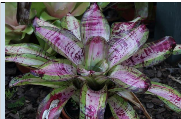
Neoregelia 'Linda Cathcart'