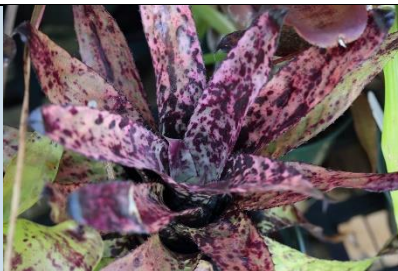
Aechmea orlandiana hybrid

President, Bromeliad Society of the Palm Beaches