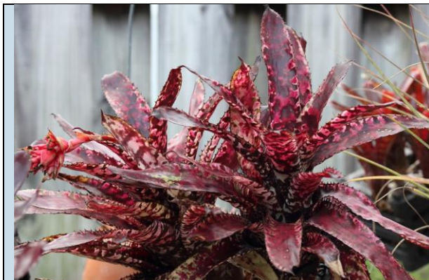
Aechmea orlandiana hybrid